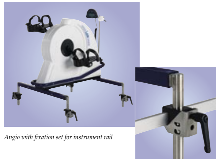
Angio with fixation set for instrument rail

Multifunctional set to mount the Angio ergometer easily on all Imaging, Physiotherapy and Examination tables that have a standard instrument rail.