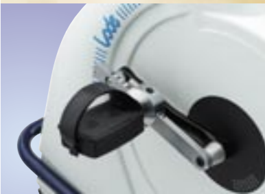
Optional adjustable cranks