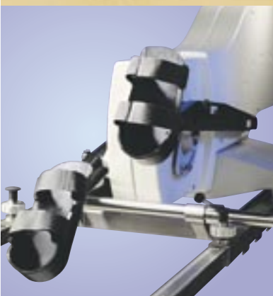
Up/down movement of the MRI ergometer