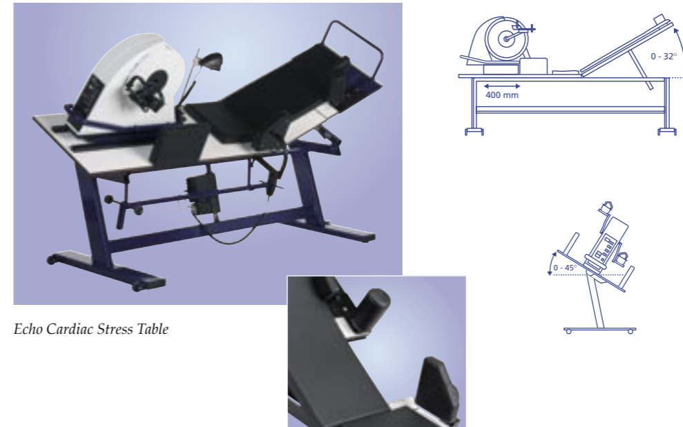
Echo Cardiac Stress Table

The Echo Cardiac Stress Table can be used for echo cardiology. By using a remote control, the test subject can be placed in a supine position with an additional 45 degrees rotation over the longitudinal axis. This transversal slope to the left brings the heart in the optimal position for the echo research and researcher. Due to a removable part of the back support (near the heart) a better view from the backside is possible. The back support is adjustable and the Angio can be slid back and forward to suit the leg length.