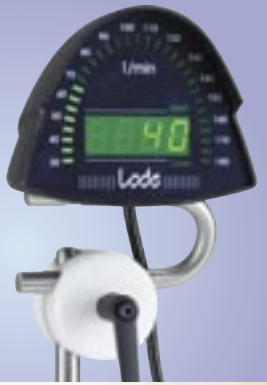
Modern designed meter for easy read-out of both the actual rpm and workload