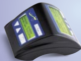
Optional Programmable Control Unit with 2 displays